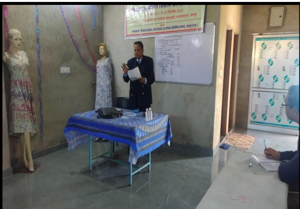
Bhoodarpura, Rajasthan, India Plot No.B-40 Flat No.101 Lalchand Pura Kadhani Bhoodarpura, Lalchandpura Kardhani, Bhoodarpura, Rajasthan 302012, India Lat 26.994229° Long 75.673827° 01/12/22 11:28 AM GMT +05:30