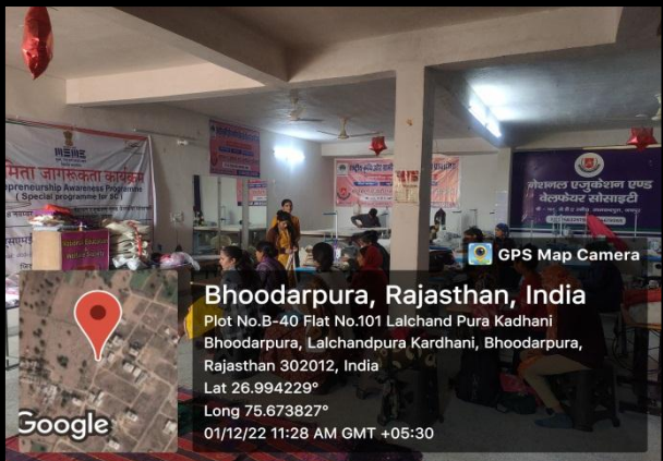
Bhoodarpura, Rajasthan, India Plot No.B-40 Flat No.101 Lalchand Pura Kadhani Bhoodarpura, Lalchandpura Kardhani, Bhoodarpura, Rajasthan 302012, India Lat 26.994229° Long 75.673827° 01/12/22 11:28 AM GMT +05:30