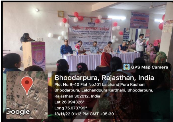
Bhoodarpura, Rajasthan, India Plot No.B-40 Flat No.101 Lalchand Pura Kadhani Bhoodarpura, Lalchandpura Kardhani, Bhoodarpura, Rajasthan 302012, India Lat 26.994326° Long 75.673799° 18/11/22 01:13 PM GMT +05:30