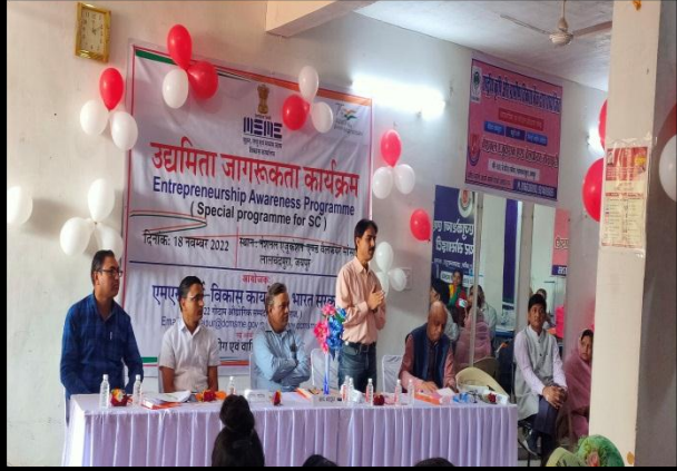
Bhoodarpura, Rajasthan, India Plot No.B-40 Flat No.101 Lalchand Pura Kadhani Bhoodarpura, Lalchandpura Kardhani, Bhoodarpura, Rajasthan 302012, India Lat 26.994275° Long 75.673806° 02/12/22 11:03 AM GMT +05:30