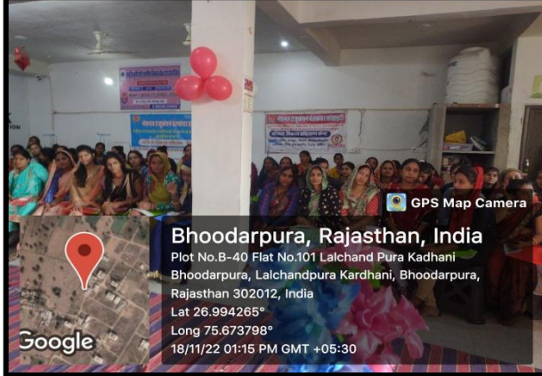
Bhoodarpura, Rajasthan, India Plot No.B-40 Flat No.101 Lalchand Pura Kadhani Bhoodarpura, Lalchandpura Kardhani, Bhoodarpura, Rajasthan 302012, India Lat 26.994265° Long 75.673798° 18/11/22 01:15 PM GMT +05:30