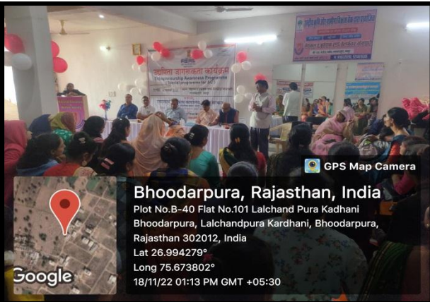
Bhoodarpura, Rajasthan, India Plot No.B-40 Flat No.101 Lalchand Pura Kadhani Bhoodarpura, Lalchandpura Kardhani, Bhoodarpura, Rajasthan 302012, India Lat 26.994279° Long 75.673802° 18/11/22 01:13 PM GMT +05:30