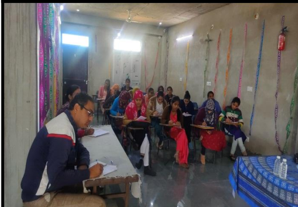
Bhoodarpura, Rajasthan, India Plot No.B-40 Flat No.101 Lalchand Pura Kadhani Bhoodarpura, Lalchandpura Kardhani, Bhoodarpura, Rajasthan 302012, India Lat 26.994229° Long 75.673827° 01/12/22 11:28 AM GMT +05:30