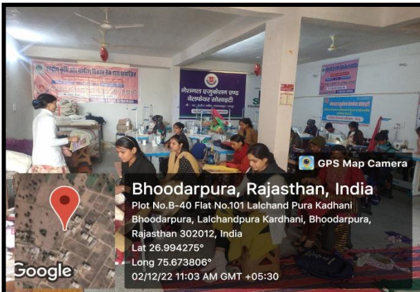
Bhoodarpura, Rajasthan, India Plot No.B-40 Flat No.101 Lalchand Pura Kadhani Bhoodarpura, Lalchandpura Kardhani, Bhoodarpura, Rajasthan 302012, India Lat 26.994275° Long 75.673806° 02/12/22 11:03 AM GMT +05:30